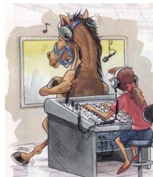
Creating a freestyle is a Team effort

Also refer to previous Directives concerning Marking of Omission and Incorrect execution in Freestyle Tests, and Directives for Assessing the Degree of Difficulty.